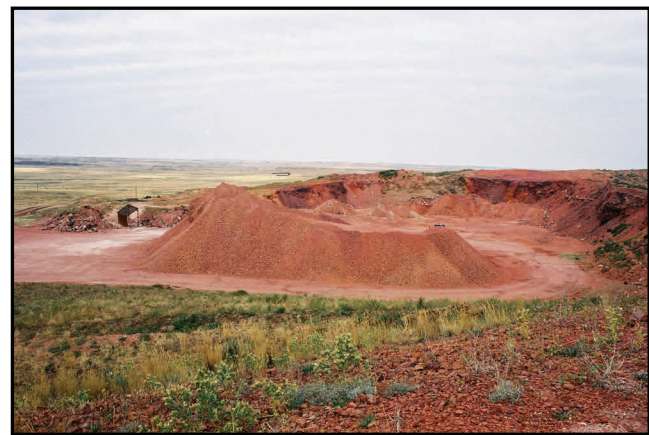
Gravel Pit, Northeast WY.