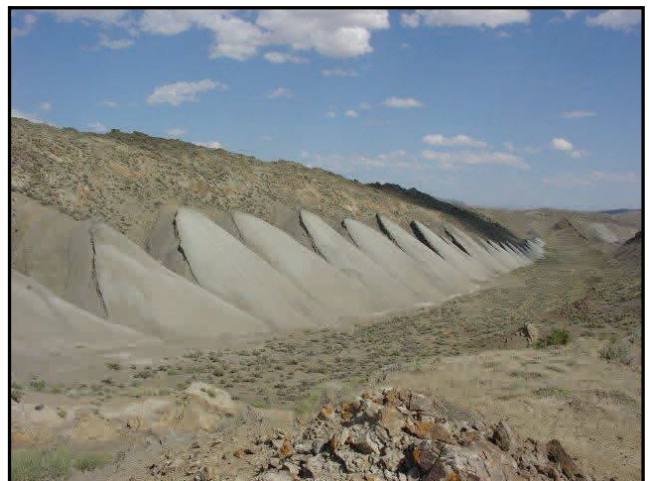
Bentonite Outcrop, Big Horn Basin, WY.