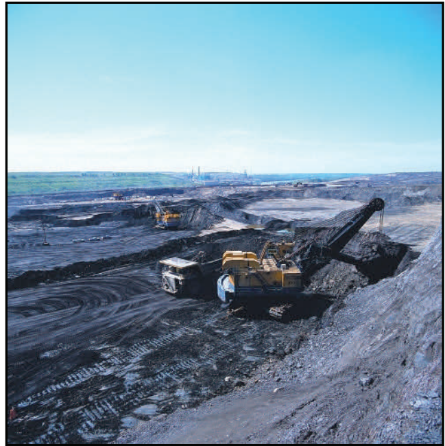
Coal Mine, Powder River Basin, WY.